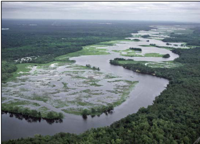
Maurice River, New Jersey