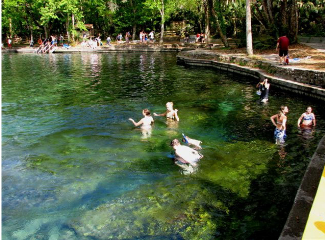
Wekiva River, Florida

https://www.nps.gov/orgs/1912/partnership-wild-and-scenic-rivers.htm