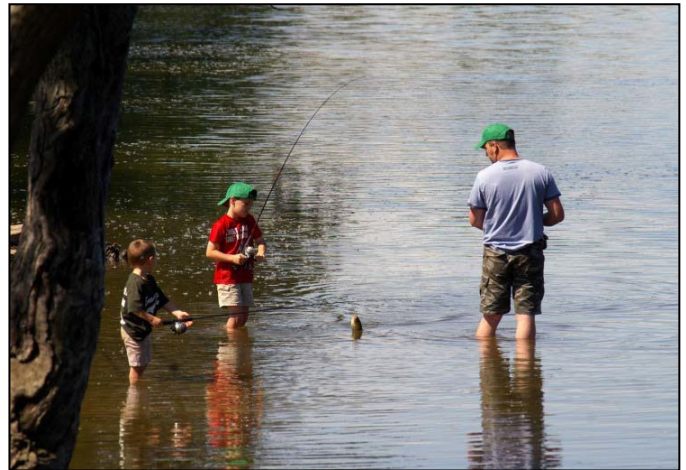
Missisquoi and Trout Rivers, Vermont