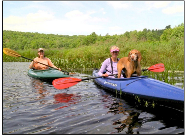
Westfield River, Massachusetts