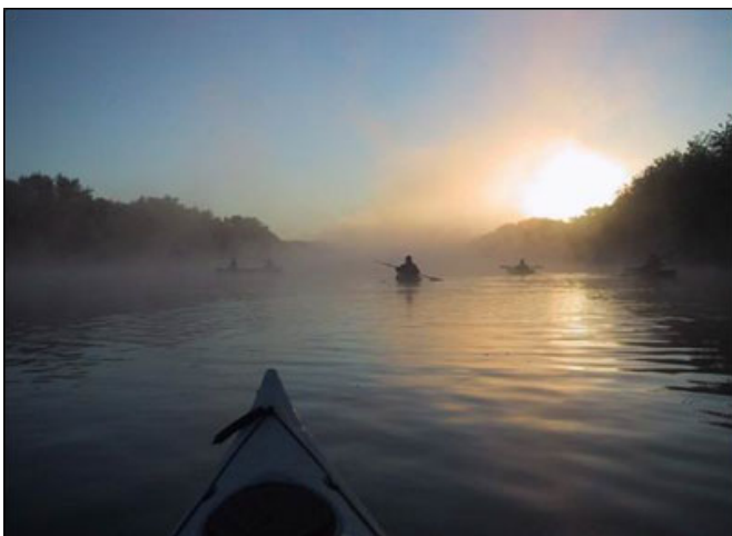
Sudbury-Assabet-Concord River, Massachusetts

Leveraging Federal Funding Locally ~ Federal support helps in leveraging additional funding from state, local, and private sources. For example, on the Great Egg Harbor River in FY2013, a federal investment of $174,000 leveraged $9,700,000 of local and state funding to preserve 5,079 acres of watershed lands by direct state purchase of land and development rights for open space preservation.