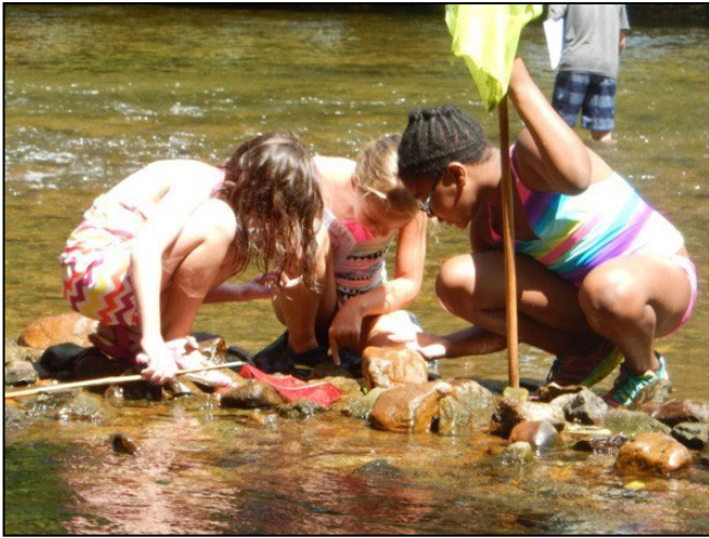
Musconetcong River, New Jersey