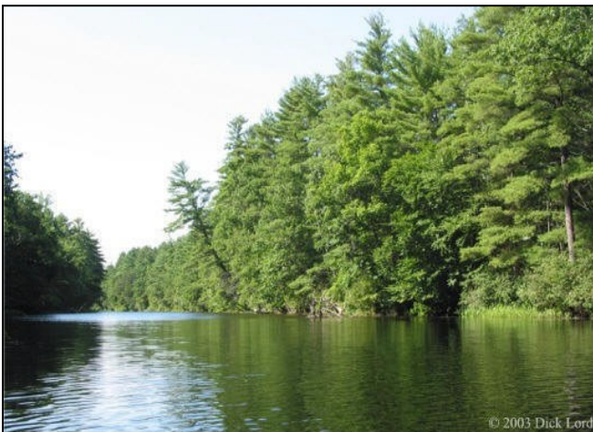
Lamprey River, New Hampshire

National Park Service Staff ~ Park Service personnel are our partners. They provide coordination, expertise, and on-going technical assistance.