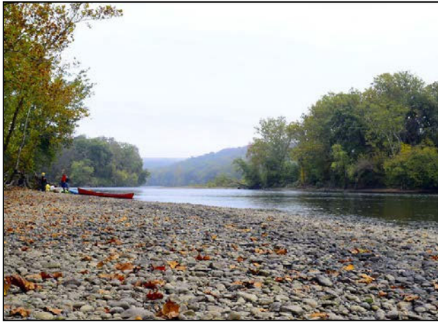
Lower Delaware River, Pennsylvania/New Jersey