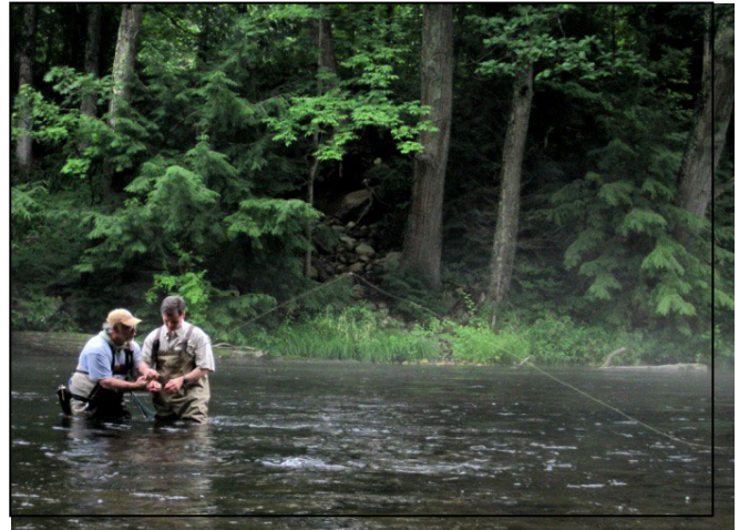
Farmington River, Connecticut

Partnership Wild & Scenic Rivers ~ A unique category of designated Wild & Scenic Rivers managed through long-term partnerships between the National Park Service and local, regional and state stakeholders. This collaborative, locally-driven planning and management approach to river conservation is an effective alternative to direct federal management and administration .