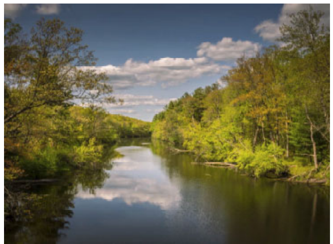
Nashua-Squannacook-Nissitissit Rivers Massachusetts/New Hampshire