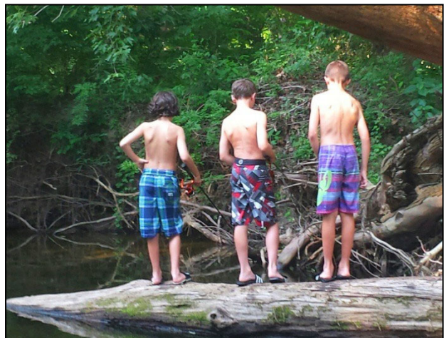
White Clay Creek, Delaware/Pennsylvania