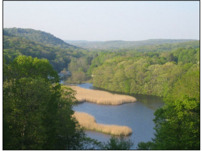
Eightmile River, Connecticut