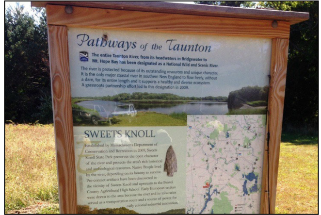
Taunton River, Massachusetts