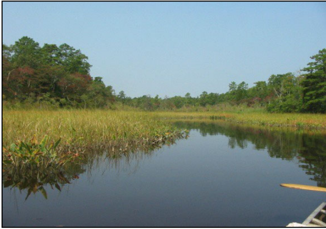
Great Egg Harbor River, New Jersey